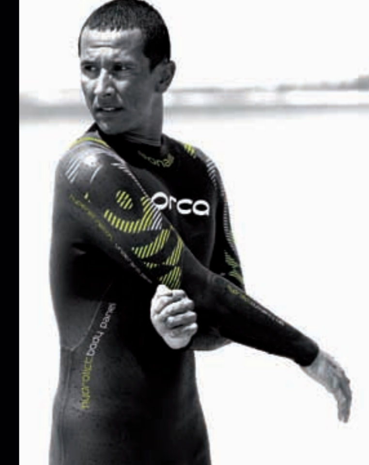
CHRIS McCORMACK 2X IRONMAN WORLD CHAMPION

SONAR THE SOUND OF SPEED CLASS LEADING INTERMEDIATE WETSUIT NEW AERODOME PANELS ENHANCE BUOYANCY RE-ENGINEERED ARM AND SHOULDER CONSTRUCTION SEAMLESS TORSO AND FULL SCS COVERAGE HYDROLIFT BUOYANCY CELLS IMPROVE STROKE