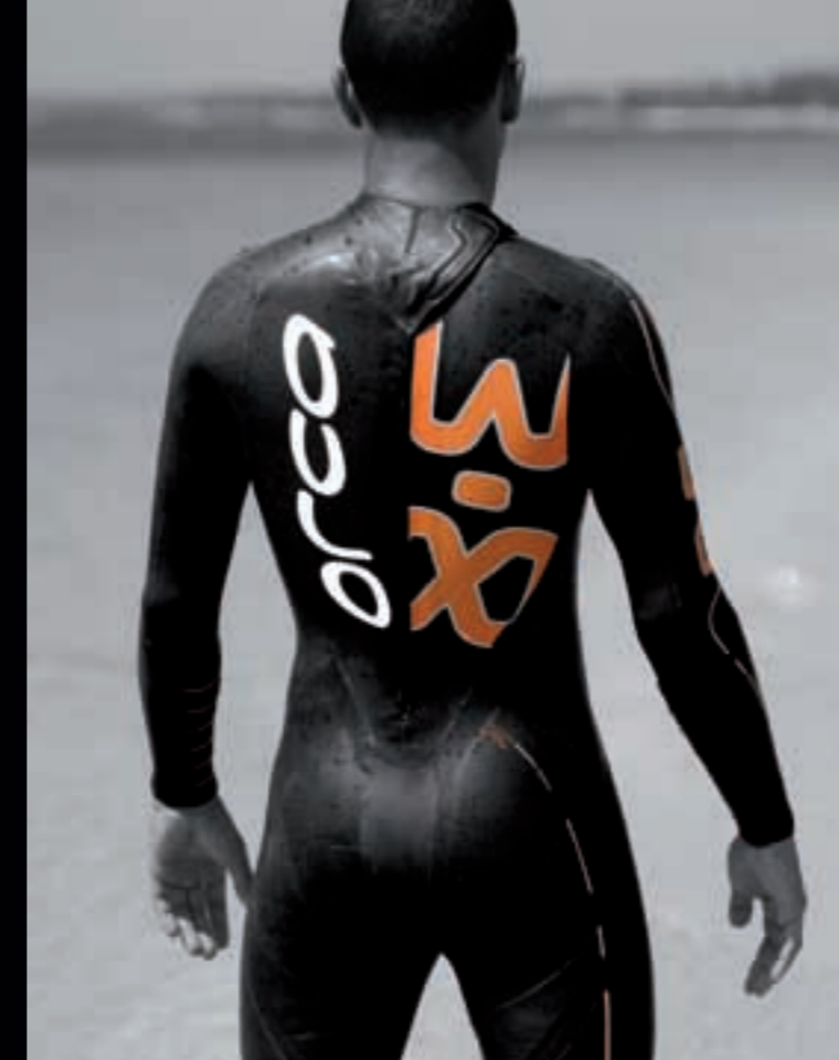
CHRIS McCORMACK 2X IRONMAN WORLD CHAMPION

3.8 FIND YOUR EQUILIBRIUM MOST BUOYANT WETSUIT ON MARKET EXO-CELL BUOYANCY SYSTEM ON FRONT/BACK OPTIMIZES SWIM POSITION YAMAMOTO #40 CELL NEOPRENE ARM PANELS HYDROLIFT BUOYANCY CELLS IMPROVE STROKE