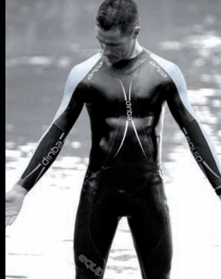
CRAIG ALEXANDER 2X IRONMAN WORLD CHAMPION

EQUIP RACE FREE PERFORMANCE TRAINING/RACING WETSUIT SCS-COATED 2MM UPPER TORSO AND ARMS FULL NEOPRENE CONSTRUCTION BROADER, MORE VERSATILE FIT